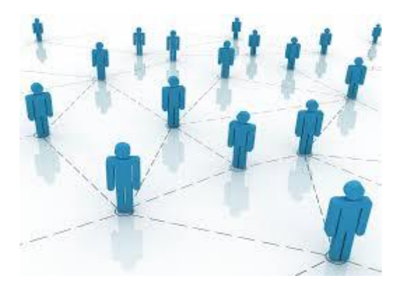
Fig 1. A simple, dyadic network

The simplest network looks something like this: